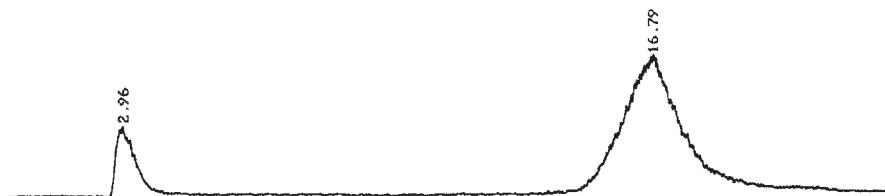
Figure 1. Radiochromatogram of a [ ^{123}\text{I} ]-4-iodo- N -(4-(4-(2-methoxyphenyl)-piperazin-1-yl)butyl)-benzamide ( ^{123}\text{I-1} ) synthesis

The iodination was conducted by electrophilic aromatic substitution of the tributylstannyl derivative ( 5 ). N -(4-(4-(2-methoxyphenyl)-piperazin-1-yl)butyl)-4-tributylstannyl-benzamide ( 5 ) (650 \mu\text{g} , 1 \mu\text{mol} ) was dissolved in ethanol (50 \mu\text{l} ). n.c.a. [ ^{123}\text{I} ]NaI in sodium hydroxide solution (15 \mu\text{l} 0.01 M), chloramine T (282 \mu\text{g} , 1 \mu\text{mol} ) and glacial acetic acid (5 \mu\text{l} ) were added. The mixture was stirred and left to react for 10 min at room temperature. Afterwards an aqueous solution of sodium metabisulphite (15 \mu\text{l} , 285 \mu\text{g} , 1.5 \mu\text{mol} ) was added to quench the reaction. 9 The mixture was purified by HPLC with ethanol/acetate buffer (0.05 M, pH 5) (35/65) as mobile phase at a flow rate of 1 ml/min. The radiolabelled product was collected ( R_t : 16 min) (Figure 1) and analysed with the same HPLC system.